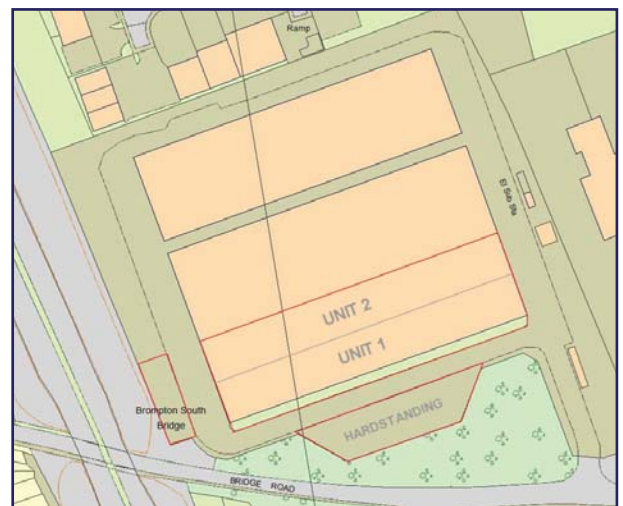
Site plan for identification purposes only.

For further information or to arrange an appointment to view please contact the joint letting agents:-